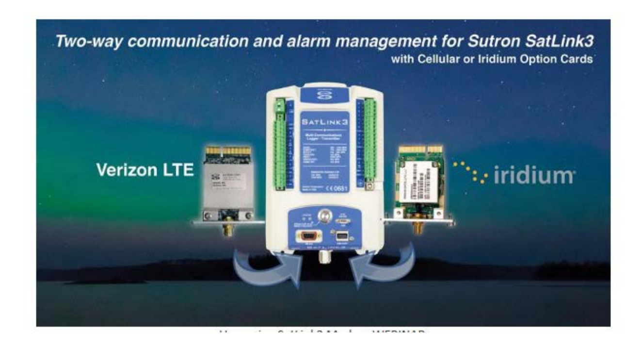
SatLink3 supports GOES, Iridium, and Cellular transmission options all with one datalogger!